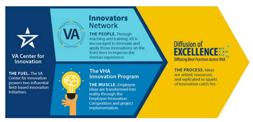
Figure 1: Innovation and Diffusion

We are building an Innovation Ecosystem comprised of mutually reinforcing parts: the VA Center for Innovation (VACI), the Innovators Network, and the Diffusion of Excellence Initiative. VACI is an enterprise entity that works with all lines of business and focuses on delivering operational breakthroughs for strategic priorities, building innovation as a capability at VA, and driving future thinking. The Innovators Network, a VACI program, empowers front-line innovators with training; a tiered grant program, which seeds and cultivates specific innovations; and continued integration into agency strategy. The Diffusion of Excellence Initiative provides a critical link in this chain by identifying, prioritizing, and driving the dissemination of top innovations and best practices across VHA. Each element in this ecosystem performs a vital function.