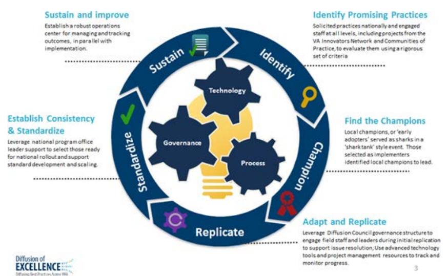
Figure 2: Diffusion Model