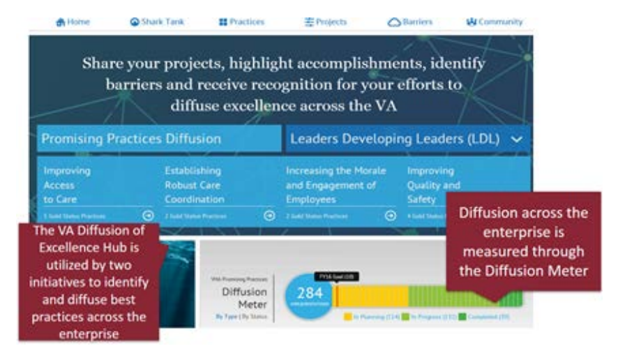
Figure 3: Integrated Operations Platform: VA Diffusion of Excellence Hub

In addition to a diffusion process based on implementation and dissemination science best practices, a fail-safe governance process and a technology platform that promoted information sharing were key to success.