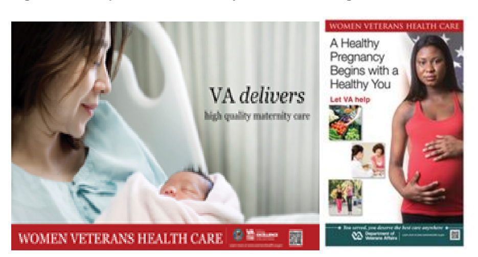
Figure 1: Examples of VA Maternity Services Messages

• VA Web Site. VA has a limited amount of information regarding its maternity services on its website. This includes a brief statement about the use of care in the community, a frequently asked questions sheet, and links to other resources outside of VA that might be of use to pregnant women. In addition, the website provides some examples of signage and pamphlets for use by VAMCs (see Fig. 1). However, it is unclear how widely, if at all, these resources are used in the individual VAMCs and other locations.