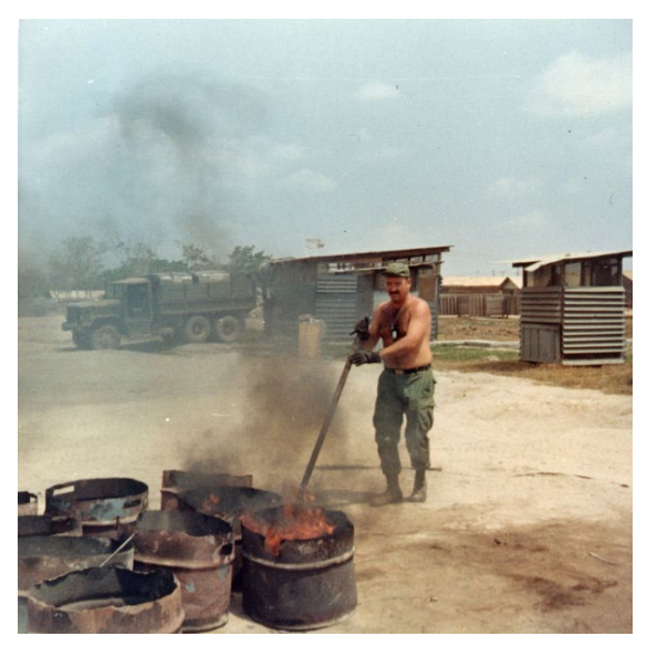
Figure 1: Burn-barrel (burn out) latrine diagram. Bureau of Medicine and Surgery, (1991), Manual of Preventive Medicine , Chapter 9: "Preventive Medicine for Ground Forces," NAVMED P-5010, Washington, D.C.

Images of soldiers performing this task shows that the fire often produced smoke. In addition to the visible air pollution and temporary, acute health effects like eye and throat irritation, breathing difficulties, and skin irritations, there are volatile organic compounds (VOCs) released from burning feces. [2] Among these VOCs several are known to cause severe, chronic illness: